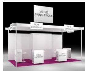
Visuel stand 18 m² - 3 faces (Paris)