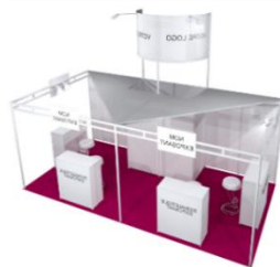
Visuel stand 18 m² - 3 faces (Lille, Lyon)